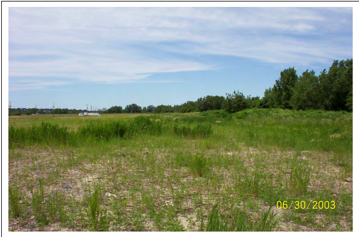
Photo 3 – Photo looking west across a grassy area north of the upper parking area and west of the debris piles. Date photo taken: 6/30/03