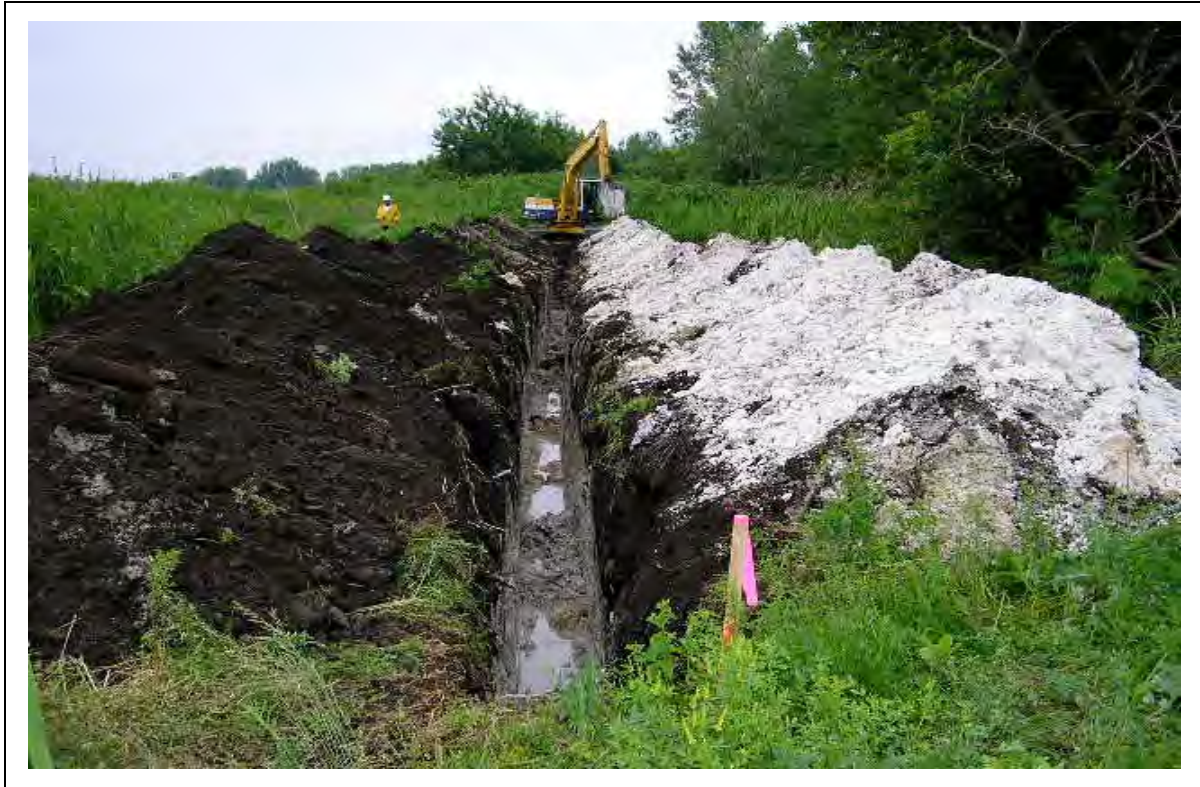
Photo 9 – Lengthwise view of TP-06 located within the Onondaga County Biosolids Area. Date photo taken: 6/2/04