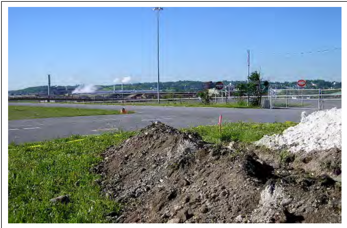
Photo 10 – Looking southeast from TP-26 in the upper parking area at the temporary background air monitoring station. Date photo taken: 6/4/04