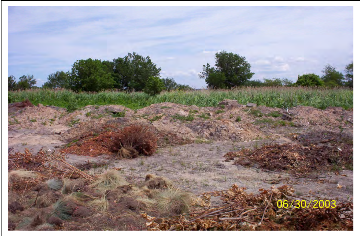
Photo 1 – Debris piles along a vegetated area in the north central/northeastern portion of the Site; photo looking northeast. Date photo taken: 6/30/03