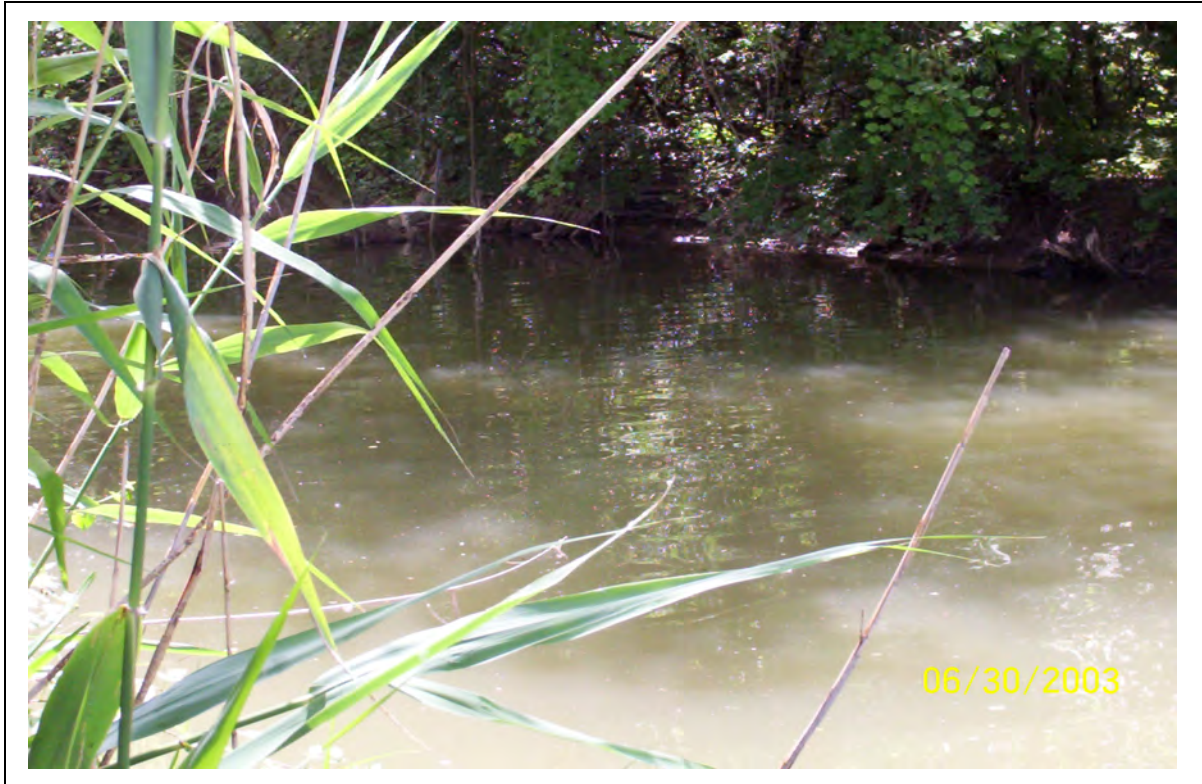
Photo 6 – Ninemile Creek adjacent to the western extent of the Site near the creek outlet to Onondaga Lake. Date photo taken: 6/30/03