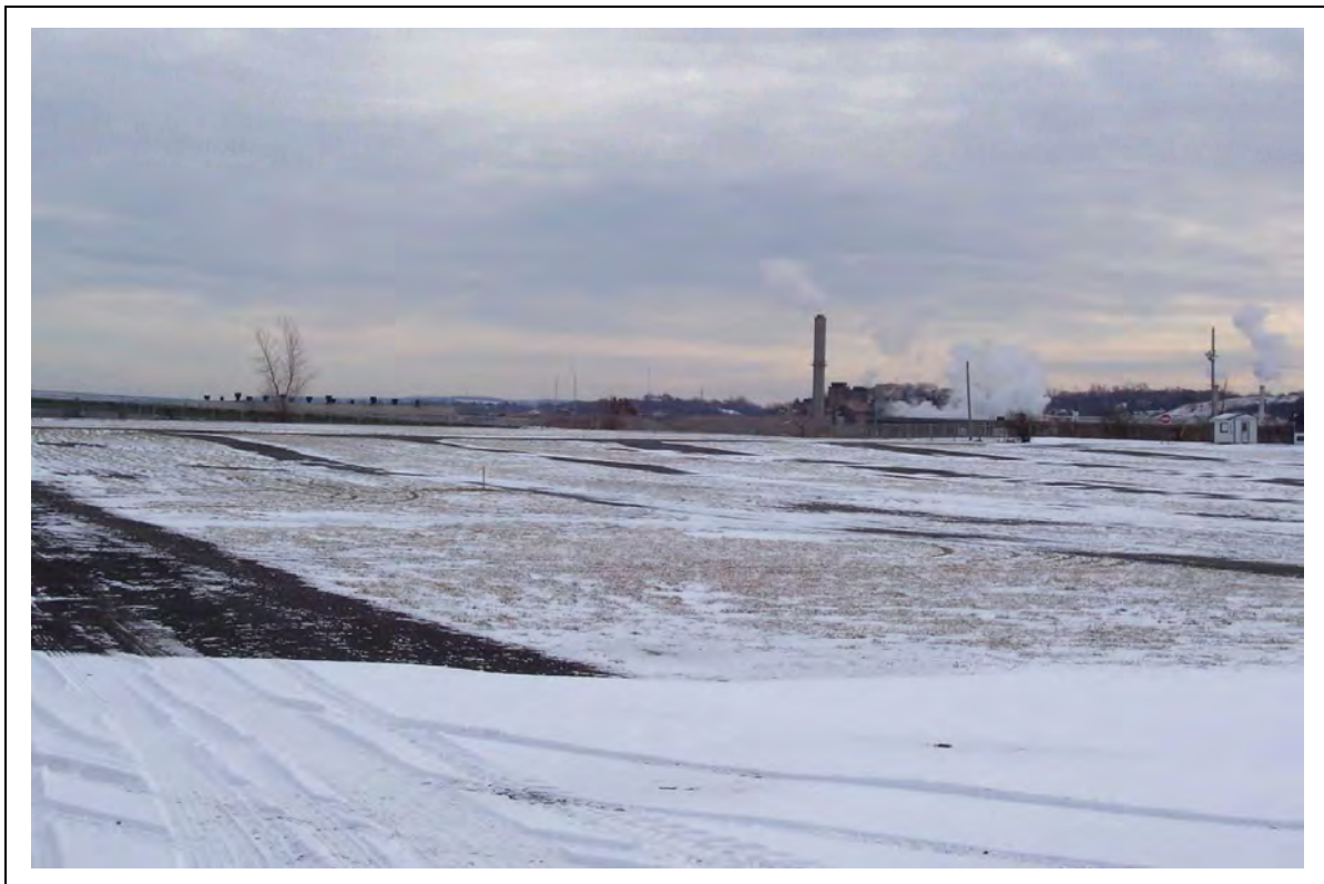
Photo 14 – Standing on Wastebeds 7 and 8 looking towards the eastern margin of the Wastebeds.