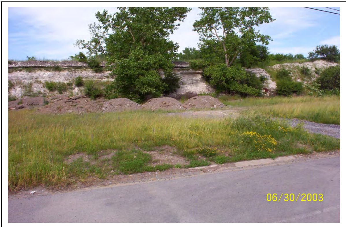
Photo 8 – Debris piles (miscellaneous materials) and berm face (exposed Solvay waste) north of the paved roadway located near the eastern gate entrance of the upper parking area. Date photo taken: 6/30/03