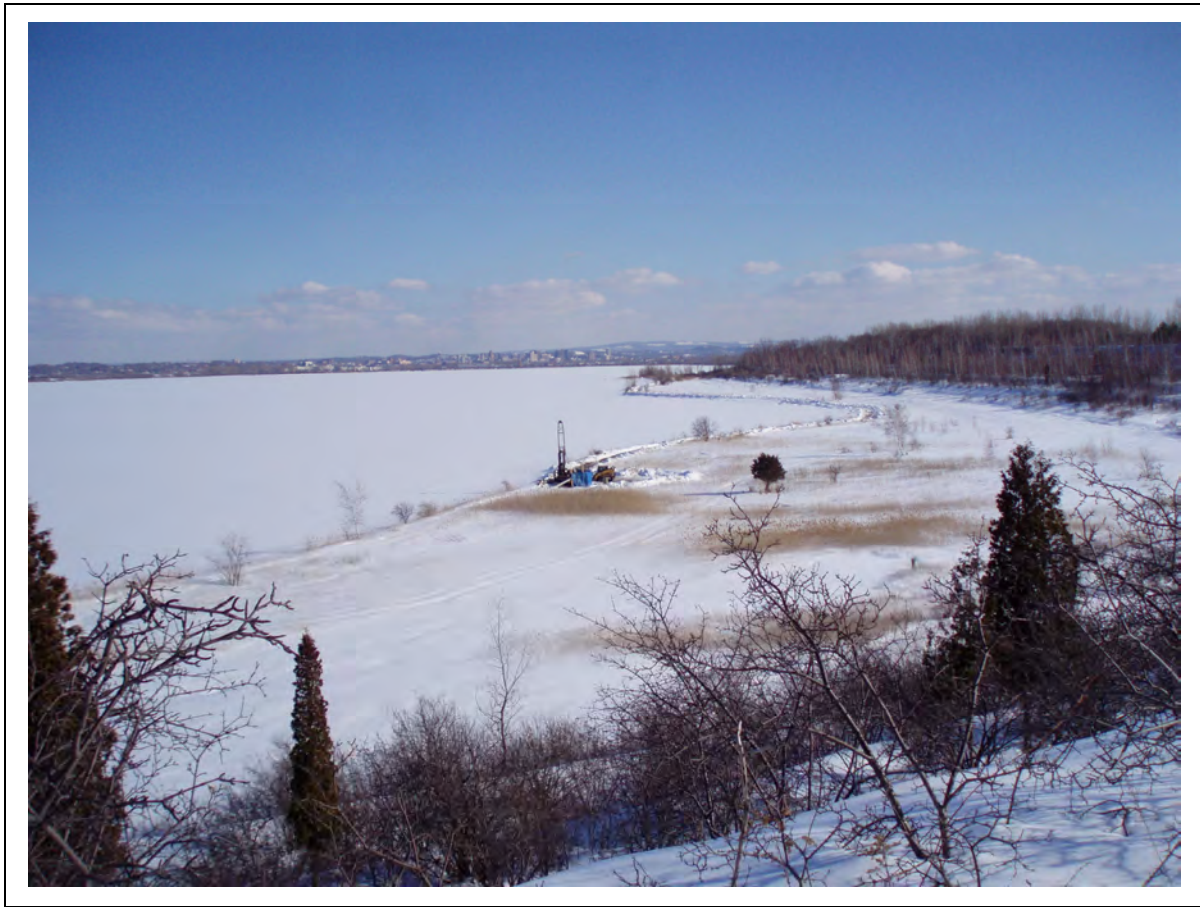
Photo 15 – Standing on Wastebeds 6 looking towards the MW-03 S/I/D/BR cluster while drilling MW-03BR.

Photo taken in February 2007 during site visit. Exact Date not known.