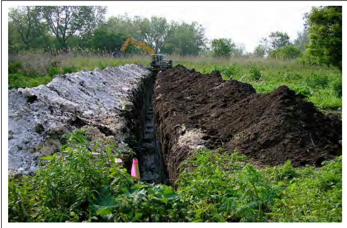
Photo 11 – Lengthwise view of TP-04 located in the Onondaga County Biosolids Area. Date photo taken: 6/7/04