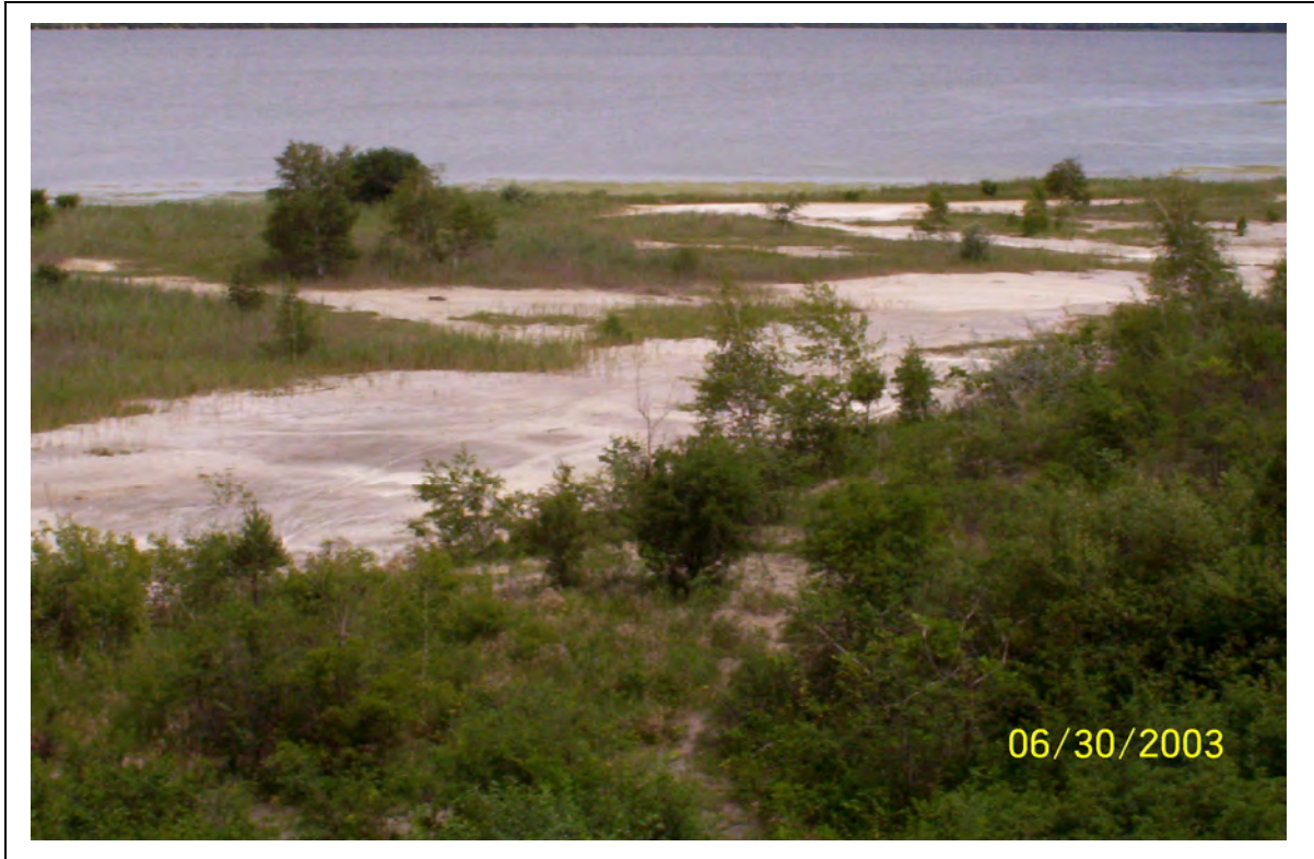
Photo 4 – Looking east along the Onondaga Lake shoreline with areas of exposed Solvay waste. Date photo taken: 6/30/03