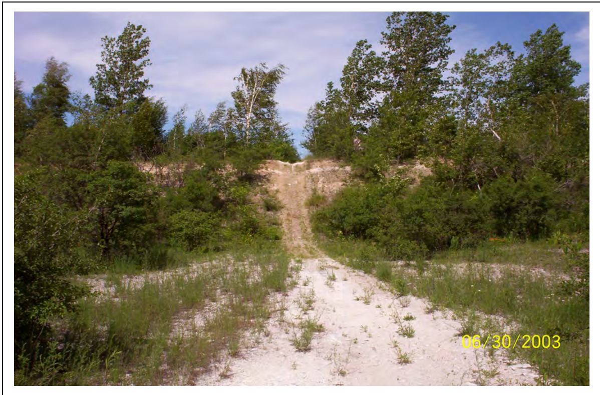
Photo 7 – Connecting path between the upper and lower perimeter paths, with evidence of all terrain vehicle use in the past. Date photo taken: 6/30/03