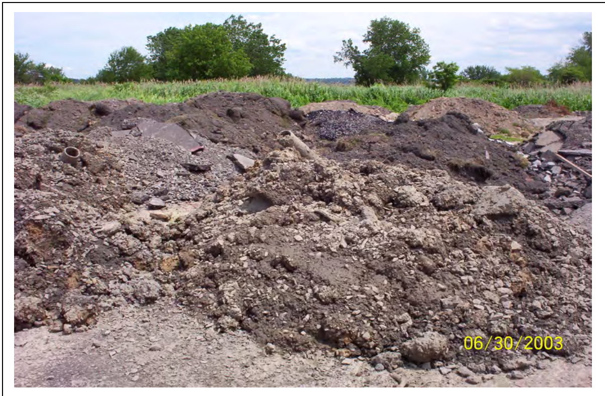
Photo 2 – Close-up photo of the debris piles; debris includes soils, asphalt, broken pipes, and vegetation. Date photo taken: 6/30/03