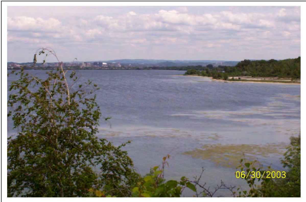
Photo 5 – Looking east along the perimeter of the Site, with the shoreline vegetation and exposed areas of Solvay waste visible. Date photo taken: 6/30/03